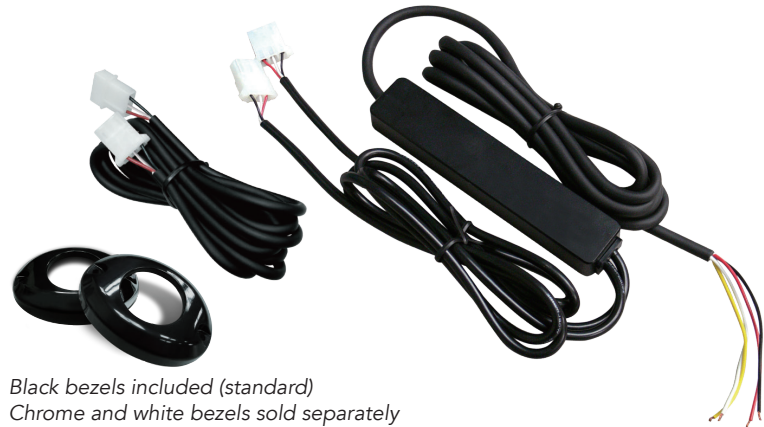
Black bezels included (standard) Chrome and white bezels sold separately