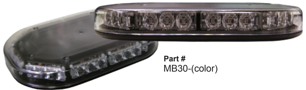
Part # MB30-(color)