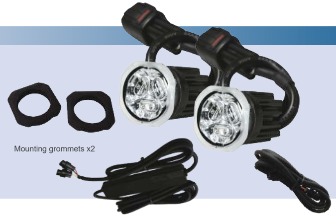
Mounting grommets x2